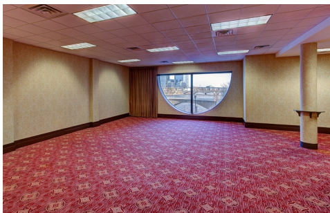
Pearl Room: for MPO Salesroom Area