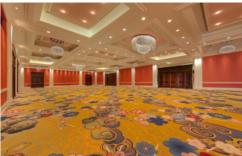
Ambassador Ballroom: for Dances