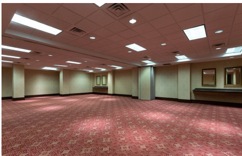
Emerald Room: for MPO 2024 Delegates Meeting, Workshop, and Songfests